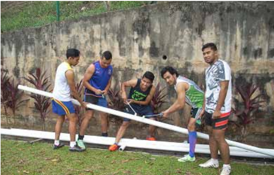
Rugby boys painting goal posts

“ We’ve been working on the goal-post, all the life long day”