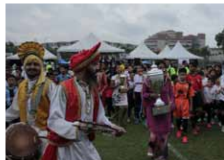
Trophy handover accompanied by the Bhanghara group

In total, there were 12 teams for the Grand Masters, 16 teams for the Masters and 16 teams for the Under-12 age group. RSC entered two teams in the Under 12 and a team each in other cat-