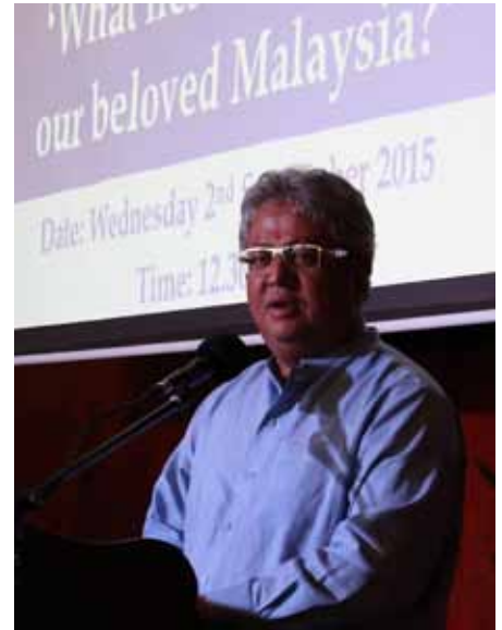
Datuk Zaid Ibrahim

It is understood that arrangements are in the works to provide exactly what members want in this respect.