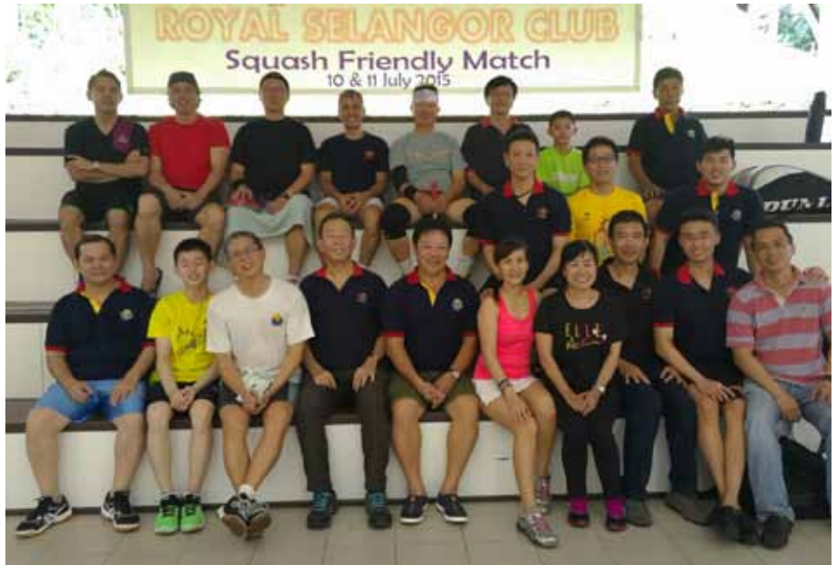
Group photo of RSC with SC.