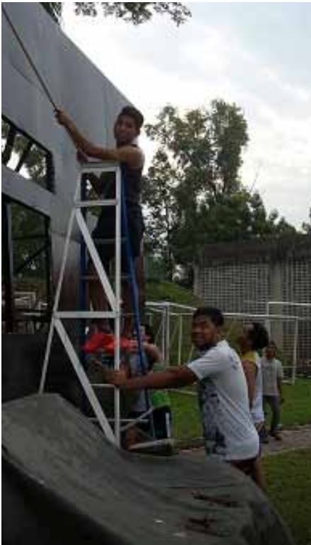
Rugby community project painting score board

Towards the dying minutes of the rubber, rugby was leading 1-0 and it was getting dark, too dark to see, but the referee refused to blow the whistle to end the game. Then through a stroke of bad light, the soccer boys equalized and the final score was 1-1.