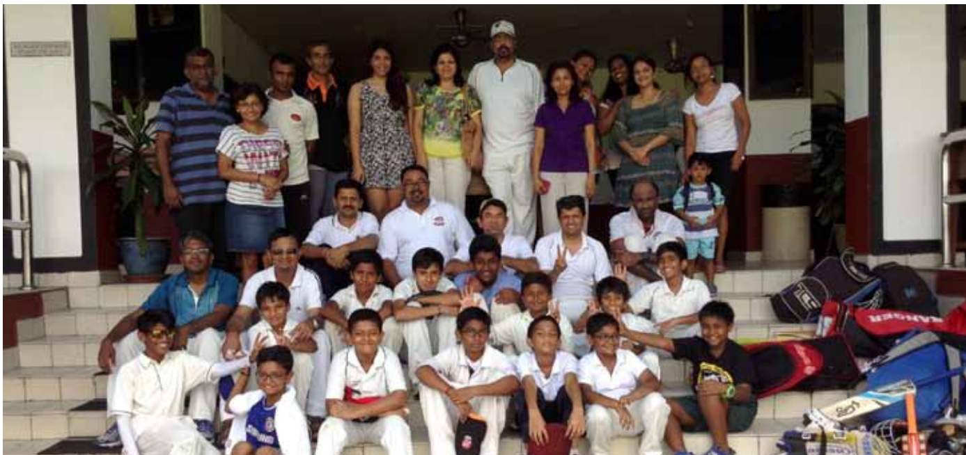
All in the family : Father batting, daughter bowling and son fielding

T he RSC Cricket Section organized a fun cricket game between the children of the Junior Cricket Program and their fathers in conjunction with Father's Day in June.