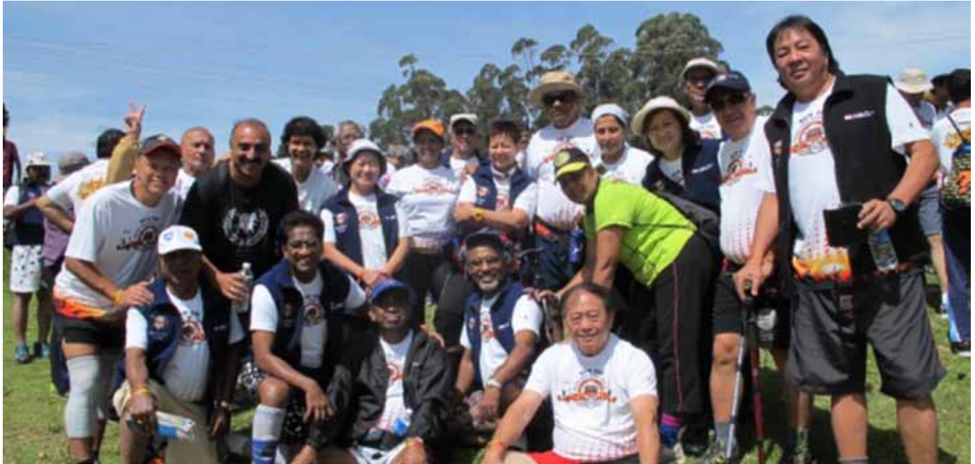
RSC Hash contingent - all ready to hit the trails

A n expedition that is not fraught with uncertainties is NOT an expedition – it is said – and true to form, so was our adventure to the South India Super Hash (SISH) from 6th to 9th August 2015.