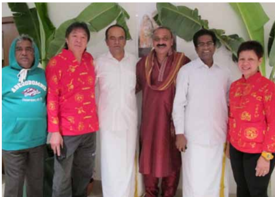
Showing off our rich tradition

The final On Down was hosted by Bangalore Hash and it saw the RSC Hash rising to the plate with our hash performance “The Melting Pot of Cultures”. The RSC Hash act was barely rehearsed with the script rewritten almost 3 times on the final day. The newbies amongst us wondered what our roles were in the skit and we were expecting a comedy of errors to confront us ...!!!! But no, it was joy! The performance of nine short acts together with the last act being a ‘bhangra’ brought the dance floor down when all the hashers joined in the revelry. Our unrehearsed act was so well received that we were given a standing ovation. We were astounded at the reception and we partied till the wee hours with